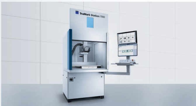
Turnkey solution: TruMicro Mark 1020 integrated in the marking system TruMark Station 7000