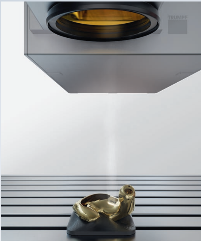
3D black marking with TruMicro Mark 1020 on an additively manufactured titanium hearing instrument