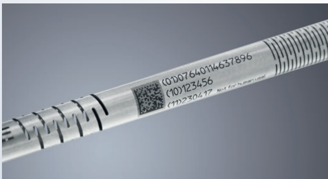
3D black marking on catheter (Alpine Laser)